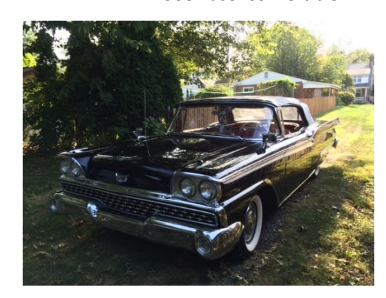
1959 Ford Convertible