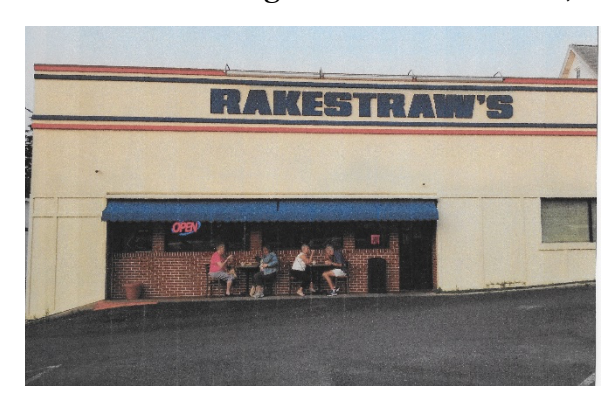
Rakestraws, Summer 2023.

Some of you will remember Rakestraws in Mechanicsburg. It was always my favorite growing up. There were other ice cream places in the area, many of them were soft ice cream, like the Distelfink on Louther Street, and Shelly's in New Cumberland to name a few. The ice cream at Rakestraws was homemade and was especially good. In the intervening sixty-plus years this iconic ice cream parlor burned down and was completely destroyed. Several years later Rakestraws was purchased by new owners who rebuilt it on the same site. I'm happy to report that Rakestraws is back in business. Instead of making their own ice cream, however, they now sell Hershey's ice cream.