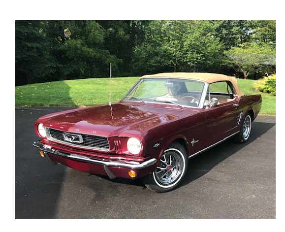
1965 Ford Mustang