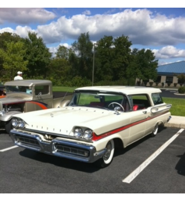
1958 Mercury Station Wagon