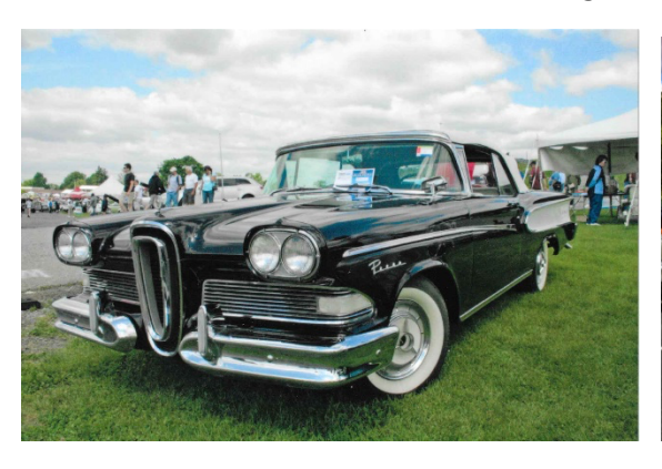
1958 Edsel Convertible